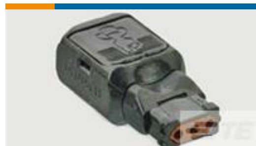
TE Part #D369-R33-NS1 369 3 WAY REC, CRIMP, SKT