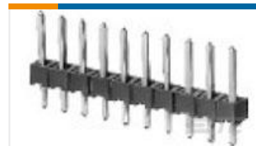
TE Part #9-146284-0 40 MODII HDR SRST B/A .100CL