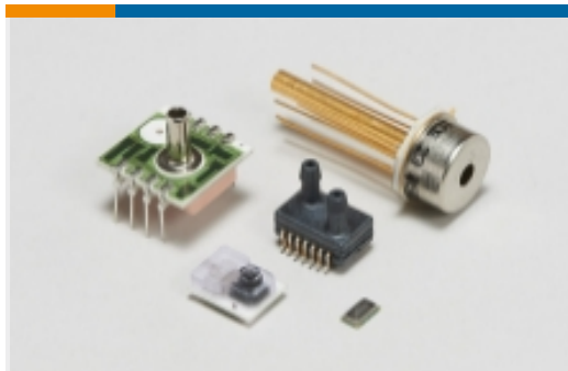
Board Mount Pressure Sensors(10)