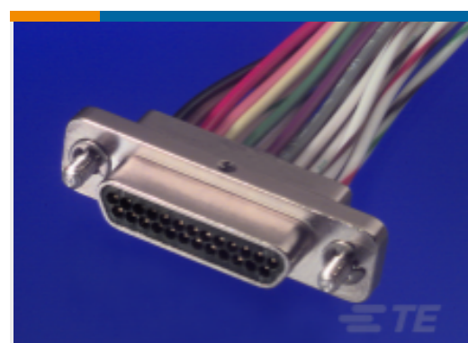
TE Part #1532182-3 M83513/03-D03N, MCKS-N1-B- 25P6G9-18.0