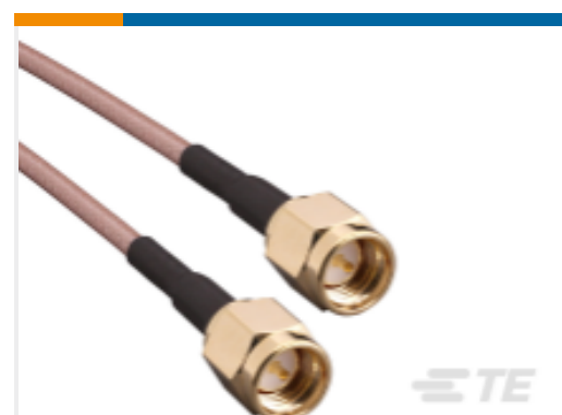
TE Part #CSE-SGAM-610-SGAM SMA to SMA 610mm RG316