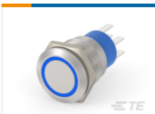
TE Part #7-2213767-7 AV19 DPL 5A MOVE RING LED BLUE 12V