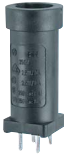
Vertical / 4 - Pin