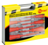
77113 Retail Box