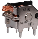
Open Type 24×19×20