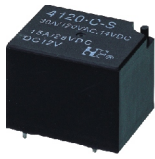
Dust Covered 26.8×21.5×22.3